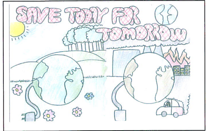
2 nd Place Winner