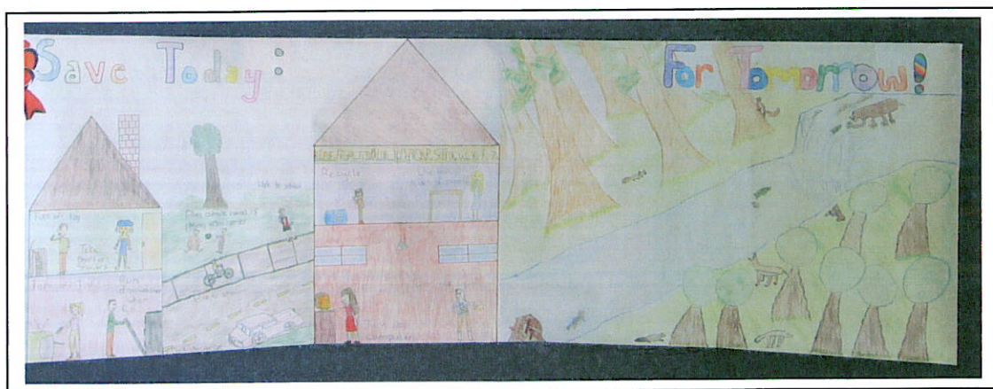
Banner Winner (Class Category)