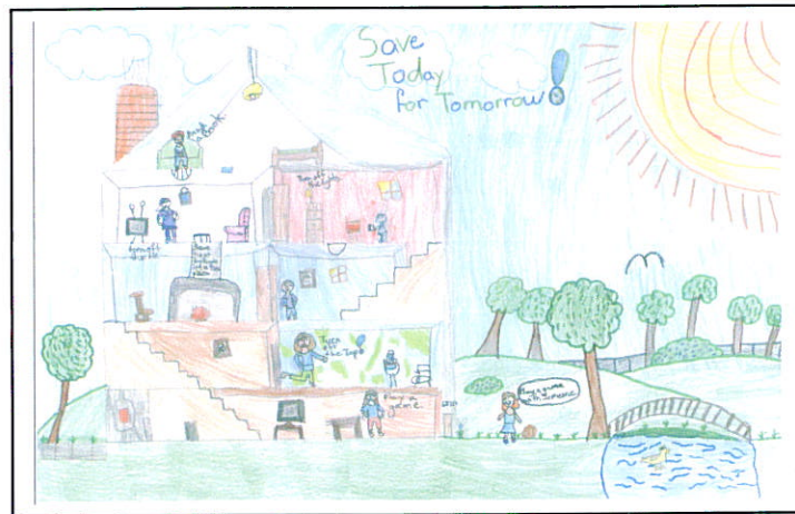
3 rd Place Winner