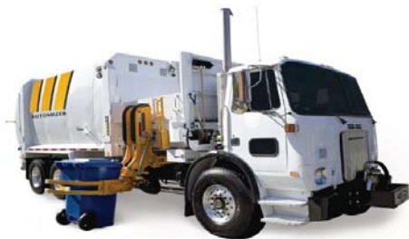
Automated collection truck

The new system will affect garbage collection in the following ways: