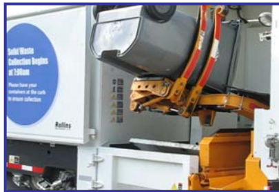
The mechanized arm lifts a cart