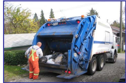
Current manual collection service

The new collection vehicles use a mechanical arm attached to the truck to lift specialized garbage carts and dump them into the truck. These types of trucks are becoming standard in the waste collection industry.