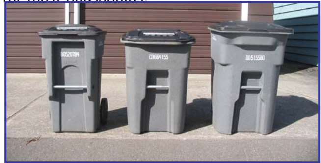
Your choice of cart size

The City may offer a small financial incentive to those residents who select a smaller sized cart for garbage.