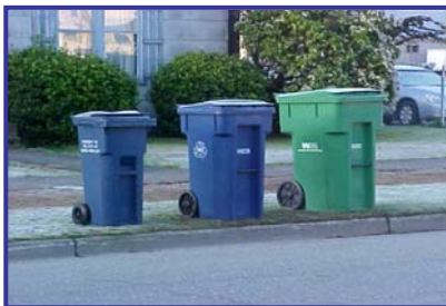
A tidy street on garbage day

In addition, because the carts are uniform in shape and colour, many residents in other cities with this kind of program say that their streets look tidier and neater on garbage day!