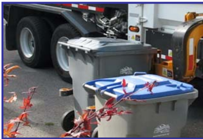
The truck approaches 2 carts