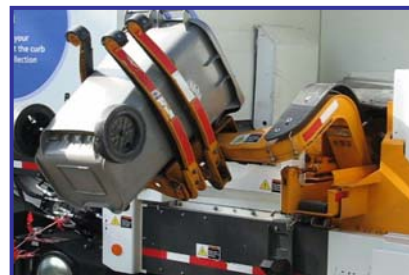
The mechanized arm returns the cart