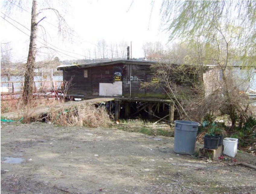
March 2010