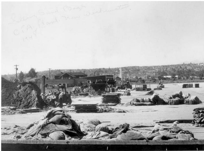
Flood Prevention in Queensborough, 1948 (NWPL 3094)

2.4 Associated People or Events of Historic Interest. Boeing Aircraft had been interested in constructing an airplane overhaul plant in Queensborough for some time, originally considering a site near the Heaps Plant, but finally choosing the site of the old "jail farm" sometime in the late 1930s. In any case, Canadian Pacific Airlines operated the site by at least 1943; in every directory up until that year, the 400 block of Ewen is listed as "gyro playgrounds." The 1943 directory however lists "ss C P A--NW 2600" (ss being the south side of Ewen). The photograph above, dated 1948 and showing the words "CPA Plant," shows the completed building (taken on account of the flood; the trucks are collecting sandbags). During the war, the CPA Plant is reputed to have employed between 450 and 600 people, many of them women due to wartime labour shortages. It is unclear thus far when CPA stopped using the site, though it was possibly immediately after the war.