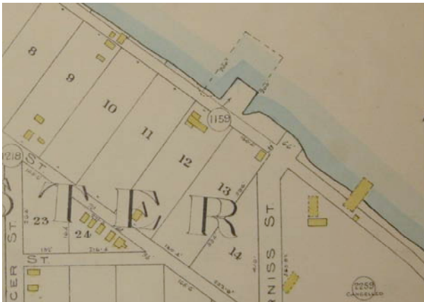
1913 (Goad's Atlas)

4.2 Context. Roughly one dozen wooden buildings of varying dimensions; industrial area but bordering recent residential project.