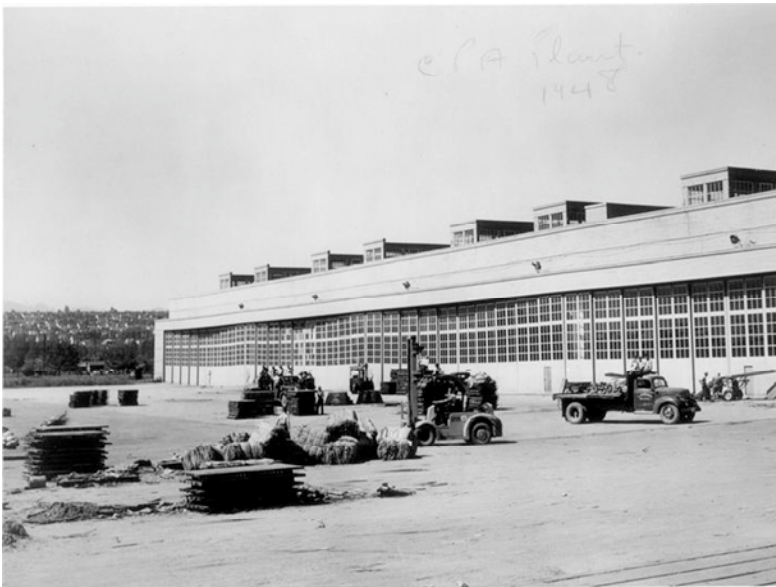
1948 (NWPL 3093)