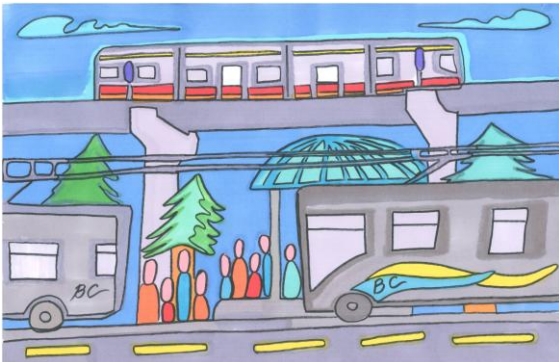
1 st Place Winner