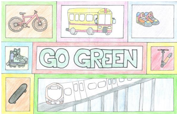
3 rd Place Winner