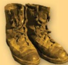
Seasonal clothing and footwear