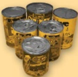
At least a three-day supply of non-perishable food. Manual can opener for cans