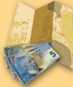
Local maps (identify a family meeting place) and some cash in small bills